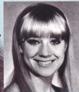
WHO AM I? SEE PAGE 12